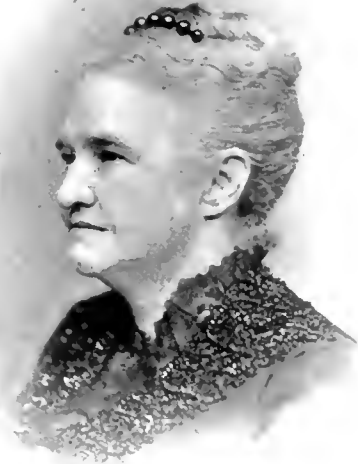
OLIVE THORNE MILLER.

MILLER, Mrs. Olive Thorne , author, naturalist and humanitarian, born in Auburn, N. Y., 25th June, 1831. She was married at an early age. Her husband was descended from a sterling New England family and Mrs. Miller said that with them "the dish-cloth was mightier than the pen," at least so far as women were concerned. In her youth it was the custom of the time to disapprove a woman's ambition to give play to her talents, and Mrs. Miller allowed herself to be guided by those about her. When her four children had grown up, she began to write for young people, but about twelve years ago she became interested in birds and wrote of their habits for an older audience and since then she has mainly confined herself to that field of work. She lived in Chicago, Ill., for twenty years after her marriage and it was in that city she made her appearance as an author. Her talents are of a high order, and her field was practically unoccupied, so that she was soon able to get a hearing. Among her productions are "Little Folks in Feathers and Furs" (New York, 1879); "Queer Pets at Marcy's" (New York, 1880); "Little People of Asia" (New York, 1883); "Bird Ways" (Boston, 1885), and "In Nesting Time" (Boston, 1888). She became known as a specialist on birds, but she has done much other literary work, including descriptive work for children, articles upon natural history and various kinds of manufactures